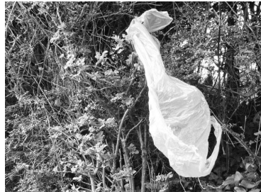
Dead duck! No, a discarded plastic bag in a Charmouth hedgerow.

a concerted effort to take our own bags to carry home our goods, the only problem with that is remembering! It won't be too long before a charge will be introduced on all carrier bags and there's nothing like a tug at the purse strings to change the way we think!