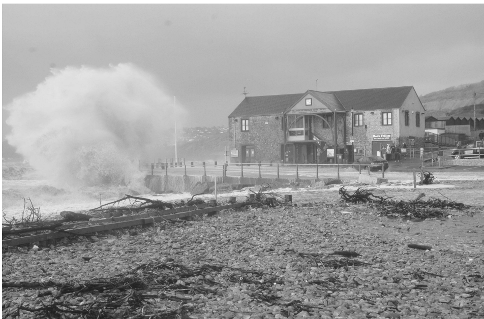
'Wave over the Heritage Coast Centre'

Berne Lane was closed for a while when trees blew down and a trampoline plucked from a lawn was dropped – like Dorothy's house in 'Wizard of Oz' - the right way up in the middle of the lane.