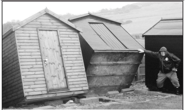
Beach Hut Saviour

Charmouth Beach Clean Sunday 20 April at 10.30am Meet at Charmouth Heritage Coast Centre. All Welcome!