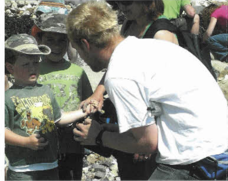
Charmouth Heritage Coast Centre Lower Sea Lane, Charmouth, Dorset, DT6 6LL

Please indicate the level of membership you would like Adult £10.00 Couple £18.00 Child £5.00 Family £25.00 (2 Adults, 2 Children) Please see overleaf for payment options I would like to make a donation Volunteer (Membership free) * To qualify as a volunteer member and receive the benefits package, we ask that you offer a minimum of 36 hours annually. (e.g. 1 desk session per month)